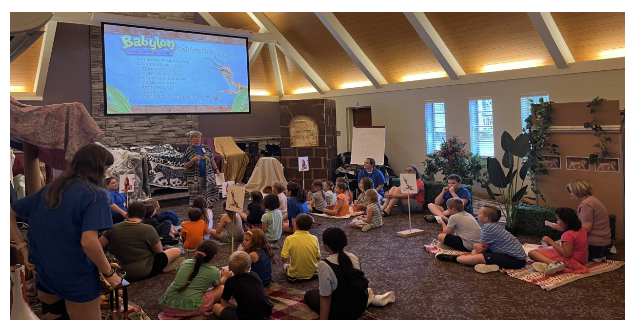
AUGUST, 2023-Heavenly Herald-Page 7