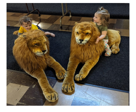
AUGUST, 2023-Heavenly Herald-Page 6